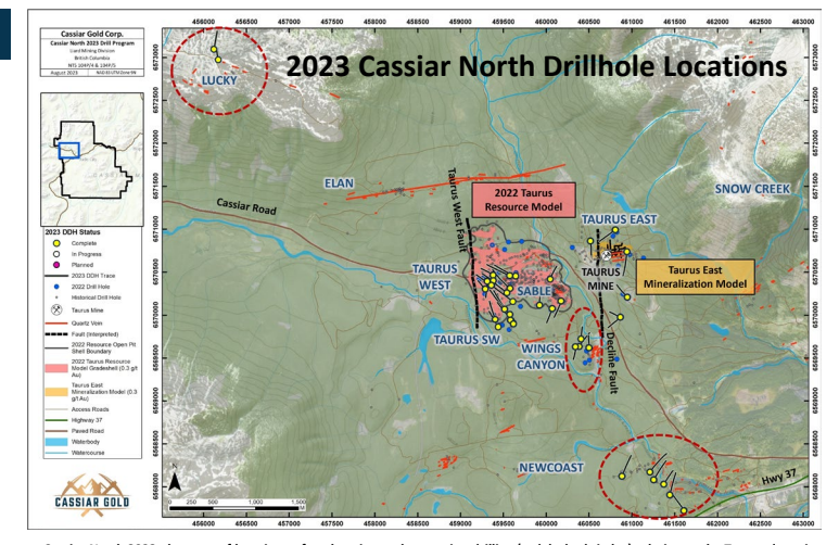
Cassiar North 2023 plan map of locations of exploration and expansion drilling (red dashed circles) relative to the Taurus deposit rface projection of the 2022 resource estimate >0.3 g/t Au grade shell is sh

<sup>1</sup>Zelligan, Moors, Jolette, April 28, 2022. National Instrument 43-101 Technical Report on the Cassiar Gold Property, prepared for Cassiar Gold Corp., and references therein